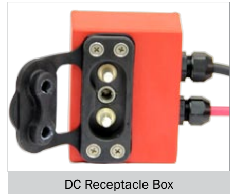
DC Receptacle Box