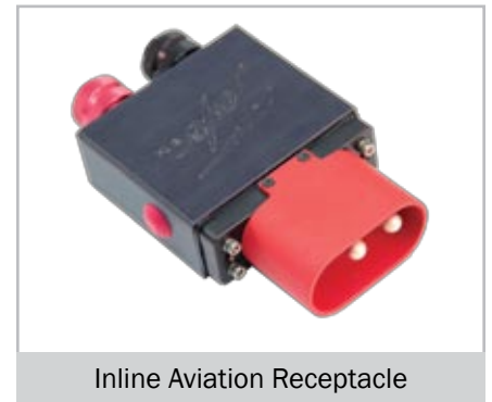
Inline Aviation Receptacle